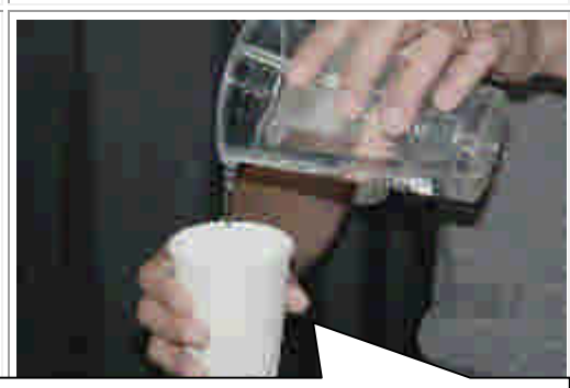
Pour water into paper cup slowly.